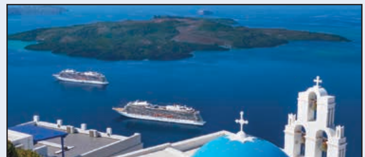
VIKING STAR & VIKING SEA IN SANTORINI

VIKING OCEAN CRUISES gives you the small ship experience with big values. Included in your fare are all onboard meals – no additional charge for the reservation restaurants; a shore excursion in each port;