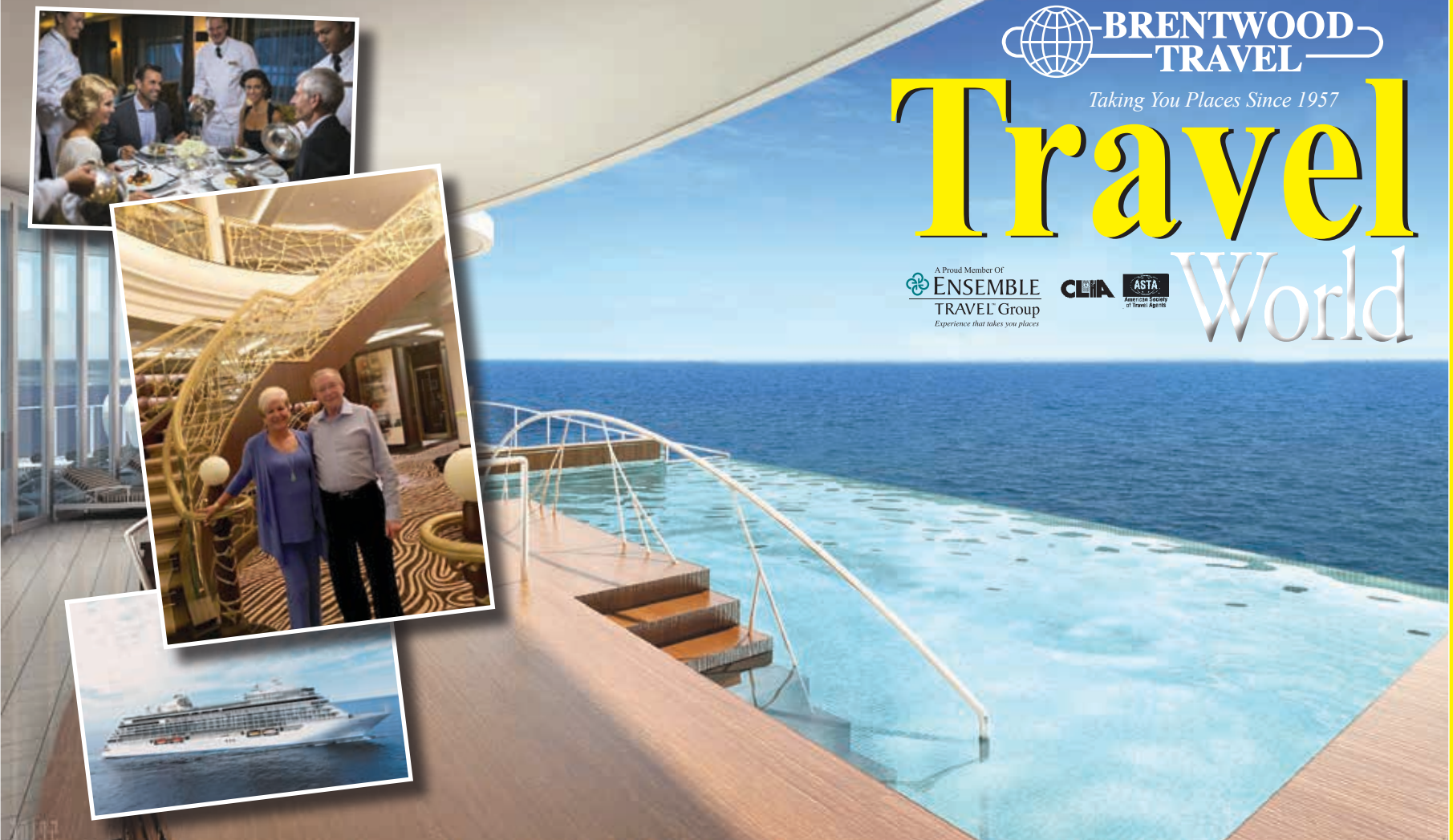
Photo: Regent's Seven Seas Explorer

CLIA ASTA American Society of Travel Agents