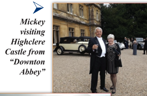
▶ Mickey visiting Highclere Castle from "Downton Abbey"