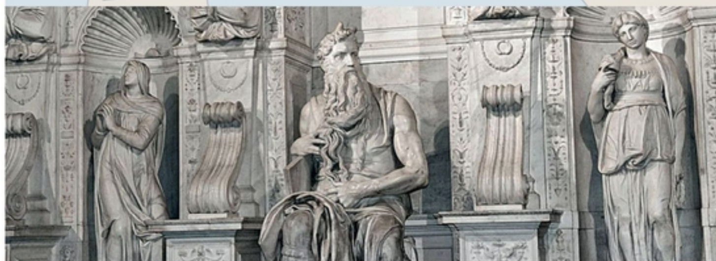
LF LOCAL FAVORITE IN ROME, SEE MICHELANGELO'S FAMOUS MOSES

① = Overnights ● = Start City ● = End City