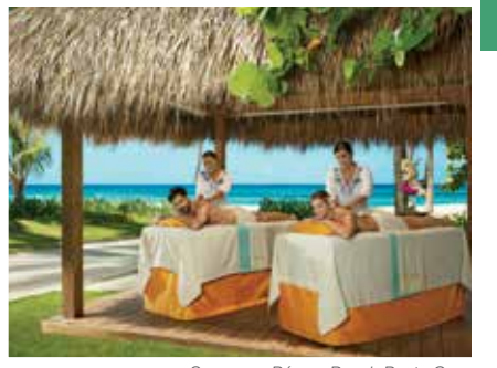
Sunscape Bávaro Beach Punta Cana

water and beer. Live music and local entertainment are included in your Unlimited Fun®, plus 24-hour access to food and beverages, and 12 restaurants with kid-friendly menu options, where no reservations are required!