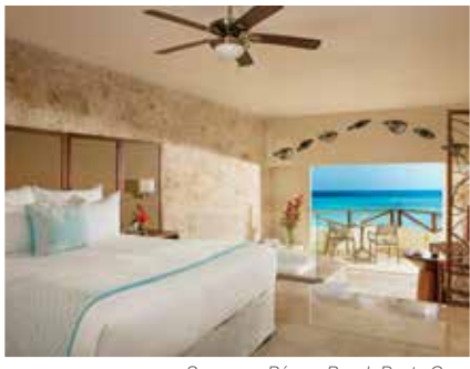
Sunscape Bávaro Beach Punta Cana

*One discount can be applied per person. Offer not valid on group bookings, cancelled or expired bookings. Promo code must be applied at the time of booking. Adjustments to past bookings or future bookings cannot be made. Changes to the booking outside the promotional period will result in the promotional code being invalid. Promo code not valid on square deal, group bookings, ski vacations and Cuba vacations.